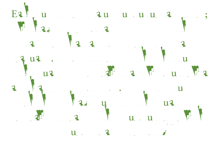
- male DDS2015 student, Day of Learning

with the International Centre and the Human Rights Equity and Harassment Prevention oce to draw on expertise and identify necessary supports and considerations for inclusion. The Faculty should consider how to deal with dierent cultural norms and expectations among students, faculty and stales as how to address inappropriate comments or behaviour students might encounter from patients.